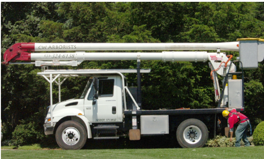
Large vehicles with a built-in basket for workers are needed to prune tall evergreens.

Regular pruning is an important aspect of evergreen care, make sure you are pruning trees properly and safely, as improper technique could do more harm than good.