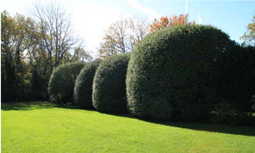
Pruned Evergreen make for a spectacular display.

East Hampton - Pruned and healthy evergreens such as White Pine, Leyland Cypress and Arborvitae are both attractive and utilitarian elements of home landscaping. As components in a privacy screen or "living wall," evergreens are valuable, because they keep their foliage year-round and provide windbreaks helping your home maintain its temperature and save on fuel bills. An important element of maintaining the health and utility of your evergreens is that they are pruned regularly and at the proper time of year.