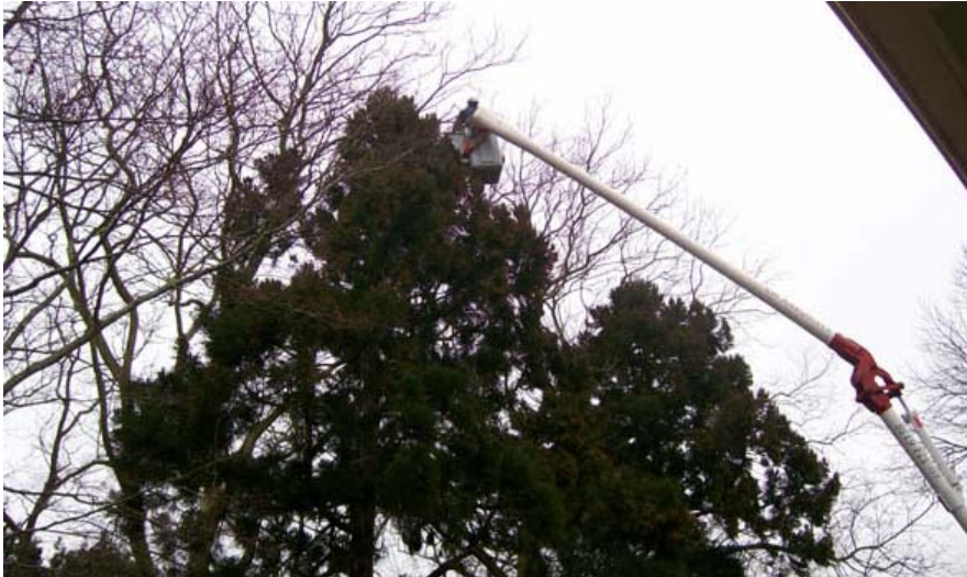
Taking special caution with an Osprey's nest.