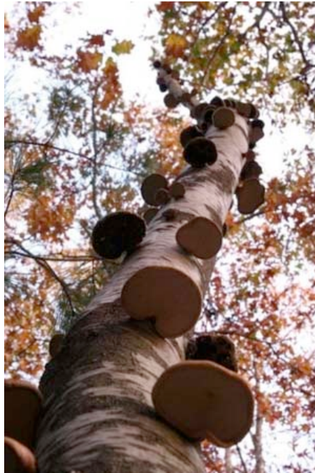
Tree in Northwest Woods showing a fungus to watch out for.