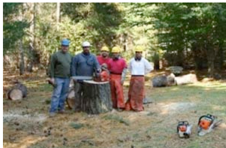
Working crew from CW Arborist - know when to use professionals.

of white pine, Leyland cypress, and hemlock. Professionals will limit pruning to deadwood and poorly placed branches in order to save as many living branches as possible.