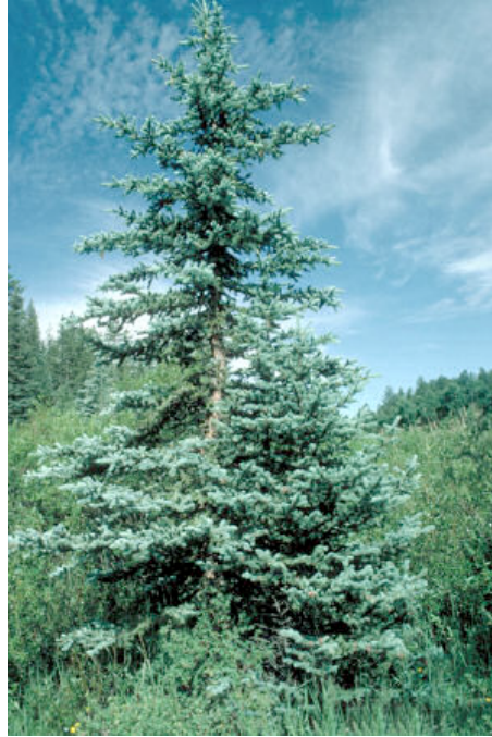
The Blue Spruce is a suitable tree for the East End.

East Hampton - The Christmas tree is usually the first and most important purchase of the holiday season. Christmas trees, which are commonly cut or artificial, are the focal point of many homes throughout the month of December and add to the holiday spirit. While locally grown plantable Christmas trees serve the same purpose as their cut and artificial counterparts, they may also add to home landscaping after the New Year and become a family tradition.