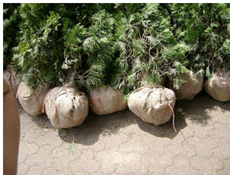
Be sure root bulbs are wrapped in burlap.

Still prefer a cut tree? Don't forget to recycle. Christmas trees can be brought to CW Arborists, Ltd. where they will be made into woodchips, call ahead for an appointment. Residents of East Hampton call 631-324-2199, and Southampton residents can call 631-283-5210, or may discard